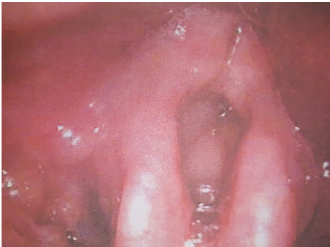
Figure 4. Indirect laryngoscopy 16 months after RT showing diffuse edema.

refused the PET-CT. Risks and benefits of the surgery were explained, which the patient understood and accepted. He opted for surgery, and a total laryngectomy was done. Final histopathology showed no residual tumor as well as chronic inflammation with fibrosis, granulation tissue formation, and necrosis, and the case was signed out as a dysfunctional larynx from post-radiation changes.