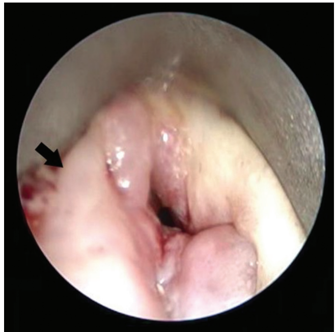
Figure 2. Direct laryngoscopy 14 months after RT; intraoperative finding of a hard fixed mass on the right vocal cord (arrow).

determining the best treatment plan which would resolve the recurrent aspiration and dyspnea.