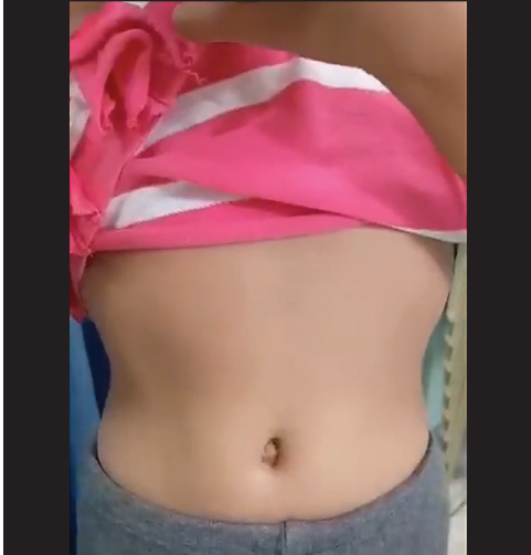
Figure 1. Screenshot of a video showing the undulating abdominal movements. The patient was awake and fully aware of the movements.