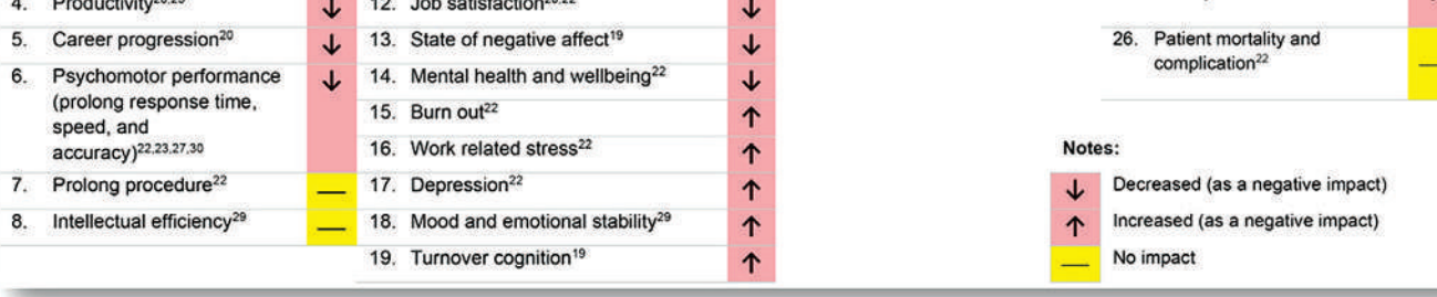
Figure 2. The proposed framework of relations among sleepiness, its manifestations, and its antecedents.<sup>19-27,29,30,35,36,49-53</sup>

system likely contributes to increased emotional activation of the amygdala and declines in sleep.<sup>51</sup> Therefore, drowsy people will lose the capability of work, memory, and learning processes that depend on the hippocampus. People with sleep deprivation are more easily distracted by negative emotional stimuli and more likely to choose based on emotional