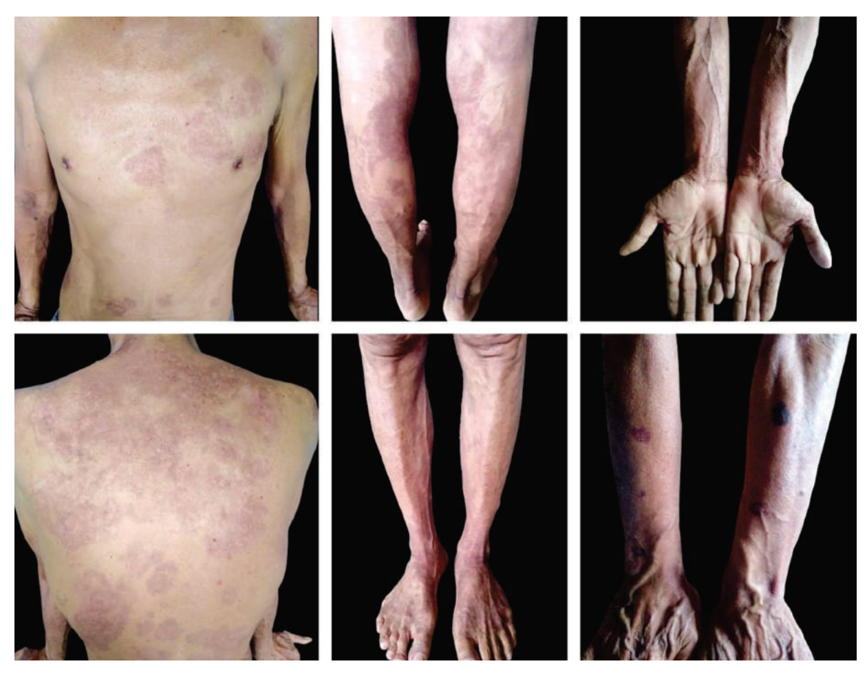
Figure 5. Complete resolution of lesions after two months of therapy. Well-demarcated, irregularly shaped, hyperpigmented patches with scalloped borders and paler center are seen on sites of previous vesicles and bullae.

scores improved from 60 to 8 and 38 to 13, respectively.<sup>6,7</sup> With improvement in quality of life, the patient regained prior functionality to perform activities of daily living.