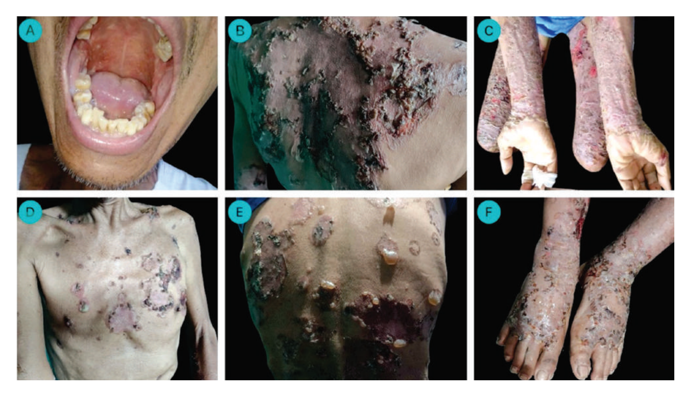
Figure 1. Photos of the patient during the initial telemedicine consult. Multiple, tense vesicles and bullae on erythematous base, some were eroded and crusted, forming an annular configuration on the trunk and extremities (B, C, D, E, F). No mucosal lesions were appreciated (A).

Hematoxylin and eosin staining of the specimen from perilesional skin showed intraepithelial splitting leaving a single layer of keratinocytes attached to the basement membrane resembling a row of tombstones. In the epidermis,