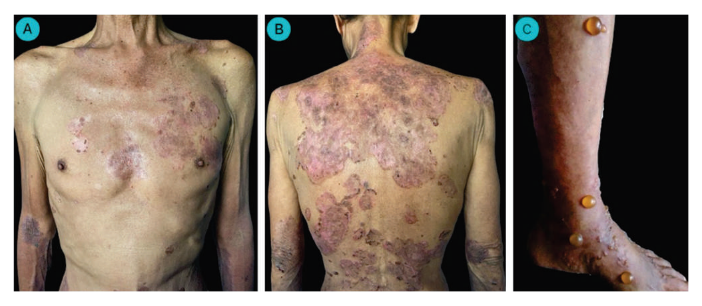
Figure 2. Marked improvement after more than a week of high dose prednisone was observed (A, B). New tense bullae and vesicles containing yellow-orange serous fluid appeared and were most prominent on the lower extremities (C).