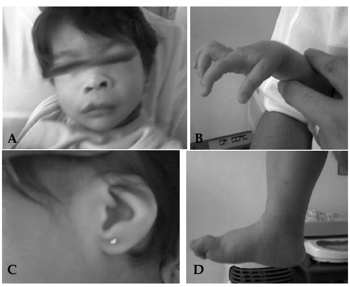
Figure 1. A) Broad nasal tip and the surgically corrected cleft lip; B) Proximal thumb insertion; C) Small lowset ear with overfolded helix and prominent antihelix; D) Slightly dorsiflexed toe.