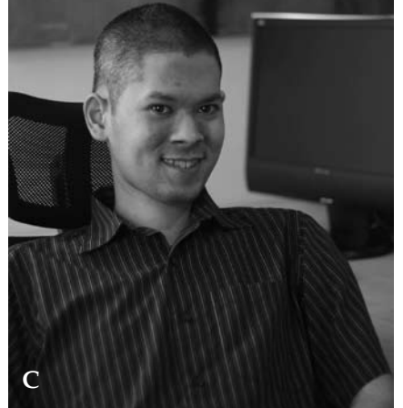
Figure 3. A) Patient with Pompe disease, wheel-chair bound at the time of diagnosis at 16 years of age. B) On Bi-pap machine which he uses 24 hours a day. C) Two years after ERT, patient tolerates 25 minutes off Bi-pap machine (with permission).