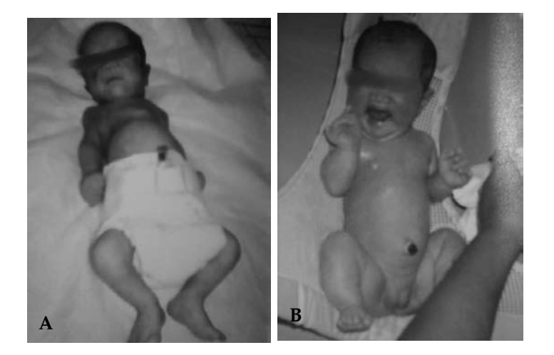
Figure 2. A) Male sibling (post-mortem). B) Female sibling during the neonatal period. Both exhibiting the long torso and short limbs.