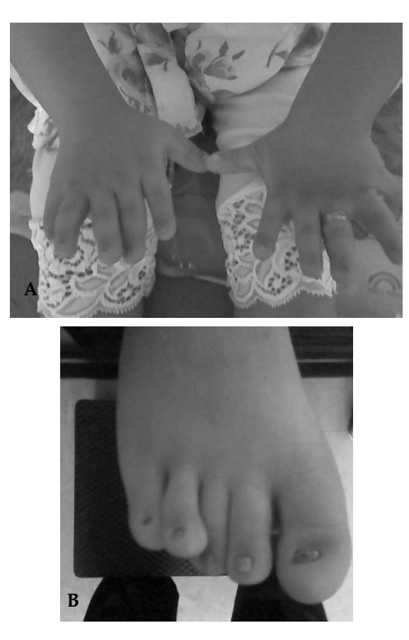
Figure 1 . A) Bilateral postaxial polydactyly. B) Dystrophic toenails with overlapping toes.

Both parents are unaffected. The family pedigree showed a 2 month old 2<sup>nd</sup> degree cousin who died due to an isolated cyanotic heart problem and a 3<sup>rd</sup> degree relative with unilateral polydactyly but with no other features (Figure 3).