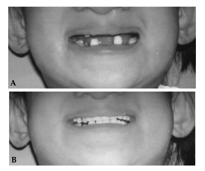
Figure 4. A) Dental anomalies in the patient. B) Patient wearing the partial dentures.

problems contributed to the demise of the male infant while cardiac surgery improved the survival and prognosis of the older sibling. Dental problems are frequent and well described in many articles.<sup>4,6,7,8,10</sup> The oral findings of upper labiogingival adhesion with multiple short frenulae, adontia, microdontia, conical teeth with short roots, and serrated gums in the female patient are consistent with these reports. No malocclusion was noted in the older child. Dental treatment plans for EvC patients usually follow multiple stages, including the use of partial dentures and surgical orthodontic procedures.<sup>15</sup> Currently, she has been fitted with upper and lower partial U-shaped dentures which has improved her profile and even general attitude and well-being (Figure 4). Bone deformities, such as genu valgum and patellar dislocation which are present in the affected female patient require regular follow up. Treatment options include corrective osteotomy of the tibia for the valgus deformity which is considered a very serious complication of this condition.<sup>16</sup> A few patients have had limb lengthening at the tibia using distraction osteogenesis.<sup>17</sup> At present, no immediate surgery is planned on this patient. The final adult height has been reported to be between 119-161cm.<sup>10</sup> However, there has been a report of 8 patients treated with growth hormone for short stature with some of them having favorable results.<sup>18</sup>