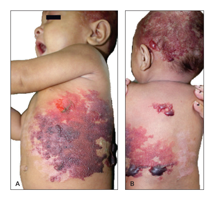
Figure 3. Views of the (A) lateral and (B) posterior trunk showed post-inflammatory hypopigmentation and hemorrhagic vesicles and bullae on patient's followup consultations.

(Figure 2B), which showed subepidermal split and dense superficial to deep perivascular, periadnexal, and interstitial mixed cell infiltrates. On Giemsa stain (Figure 2C and 2D), numerous mast cells were highlighted at the dermis. Direct immunofluorescence (DIF) was negative, making the diagnosis compatible with diffuse cutaneous mastocytosis of the bullous type. The patient was given cetirizine, antibacterial ointment, and saline compresses which led to the resolution of the lesions. Caregivers were then educated regarding the nature and prognosis of the disease and were instructed to avoid any forms of trauma to the patient's skin.