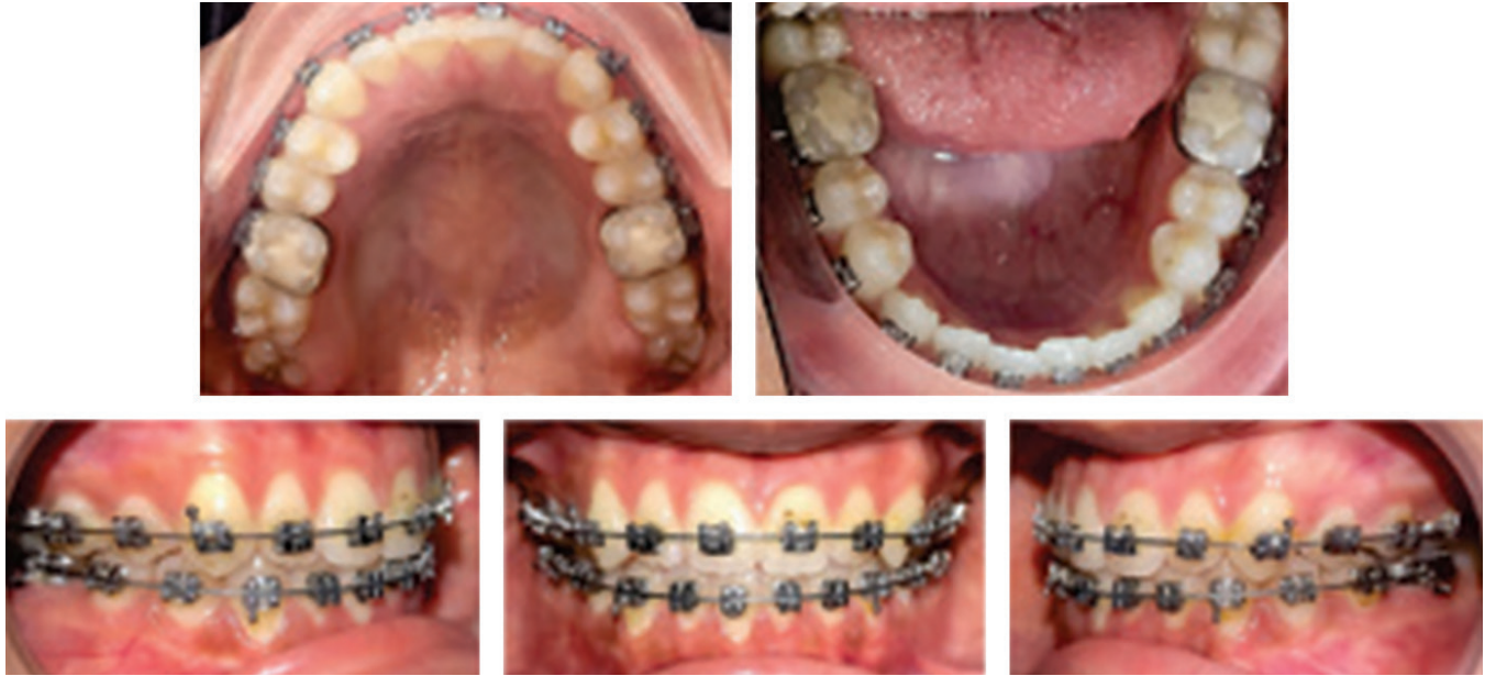
Figure 3. Patient's intraoral photographs during treatment.

A thick, wide maxillary labial frenulum attached close to the gingival margin is often considered a contributing factor for midline diastema and delayed growth of the premaxilla. 6 The maxillary labial frenulum is a fold of tissue, usually triangular, extending from the maxillary midline area of the gingiva into the vestibule and mid-portion of the upper lip. 9 The primary role of the frenulum is to provide stability to the upper lip and maintain a balance between the growing bones. 6 An "abnormal" frenulum is clinically defined as a prominent tissue band with an attachment in the palatine papilla showing some blanching when tension or pull is exerted on it. 10 Some disadvantages and disturbances that frenulum abnormality causes are diastema, abnormal position of the anterior central incisors, rapid dental caries, periodontal problems arising from food impaction, esthetic concerns, and upper lip damage. 5