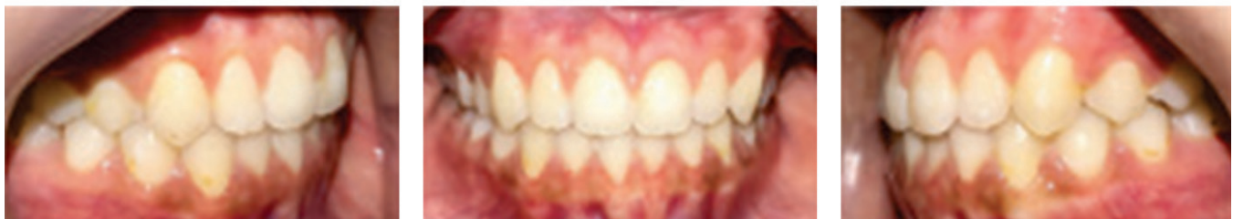
Figure 4. Patient's extraoral and intraoral photographs post-treatment.

finishing and detailing as the last step. The late control and busyness of the patient as a medical student at Airlangga University made her undergoing orthodontic treatment longer than usual. The total time of orthodontic treatment was 30 months (Figure 4).