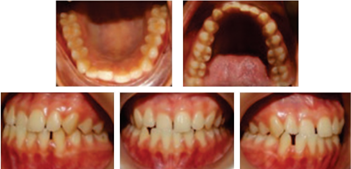
Figure 2. Patient's intraoral photographs pre-treatment.

maxilla and mandible showed a skeletal Class I relationship with a value of \angle ANB 4^\circ , and a Wits appraisal of 0 mm. The dental inclination of the maxillary incisors was upright with a value of \angle I RA-NA 19^\circ , and the mandibular incisors protrusive with a value of \angle I RB-NB 32^\circ , \angle IMPA 102^\circ , and \angle FMIA 40^\circ . Soft tissue analysis showed a convex profile with a value of \angle GSn-SnPog' 17^\circ , nasolabial \angle 96^\circ .