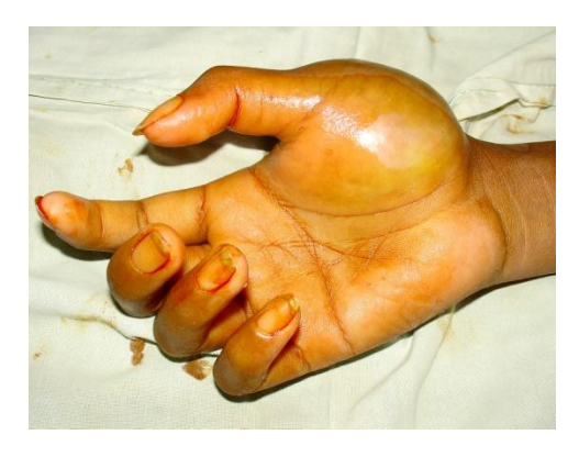
Figure 1. Large tumor, dorsal side of thumb metacarpal area.

The distal autograft was fused with the proximal phalanx base using tension band wiring. The CMC joint was reconstructed with soft tissue arthroplasty using the flexor carpi radialis (FCR). The FCR was cut as far proximal as possible at the musculotendinous junction and delivered distally at the level of the first CMC joint (Figure 4). It was inserted through a hole at the proximal end of the autograft and tied and sutured to itself to create a suspension ligament. The remaining tendon was folded and sutured to an "anchovy" which was interposed between the autograft and the space left with the excision of the trapezium. (Figure