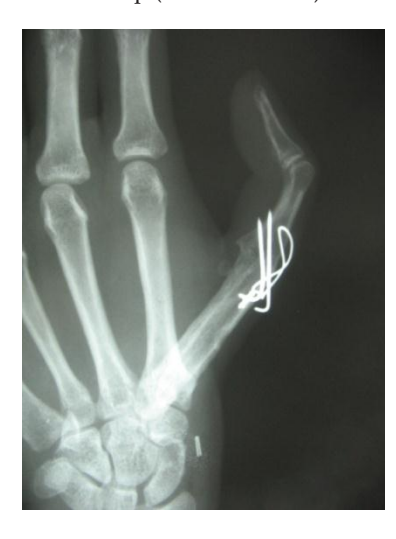
Figure 6. On follow-up radiographs, thumb MP joint fused at 6 months after surgery.

The patient presented with good function and is satisfied with her condition as measured by pre- and postoperative DASH<sup>5</sup> and serial postoperative Revised Musculoskeletal Tumor Society Rating Scale (MSTS)<sup>6</sup> at 6 and 24 months follow-up (Tables 1 and 2).