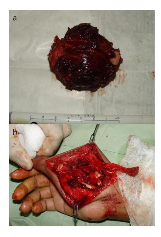
Figure 3. (a) The tumor excised with the MP joint, trapezium and thenar muscles as margins of excision, (b) the defect after excision with transected EPL.