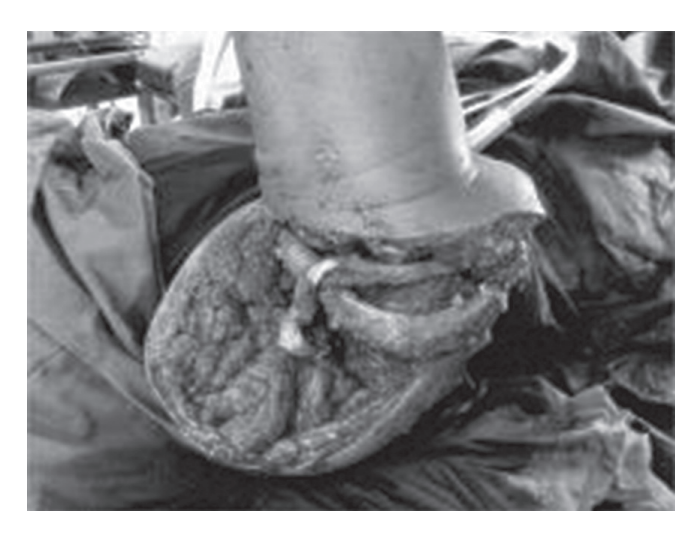
Figure 5. The vessels and nerve are coiled carefully to prevent kinks and are then placed within a soft-tissue bed in the anteromedial thigh. The investing fascia is not closed to reduce the risk of compartment syndrome. The skin is approximated with staples, and any excess skin is removed approximated with staples, and any excess skin is removed.