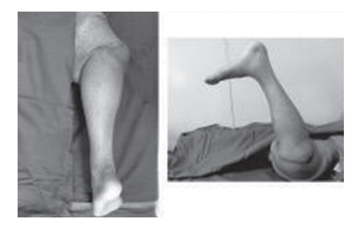
Figure 6. Post-op range of motion of hip and ankle (knee).