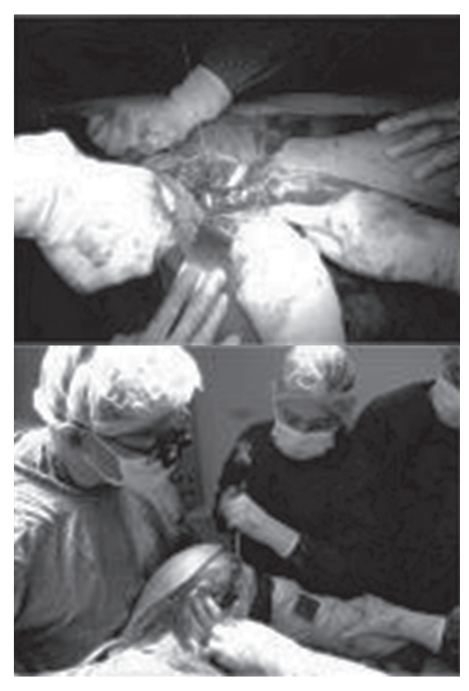
Figure 3. Femoral osteotomy and tibial osteotomy.