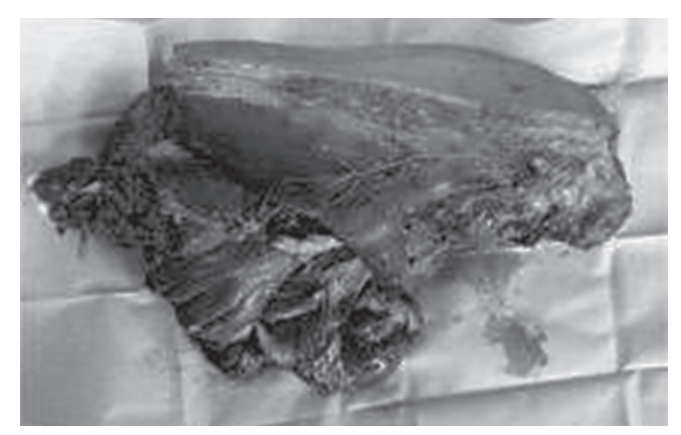
Figure 4. The intercalary segment is then removed, and the distal segment is externally rotated 180° while ensuring that the neurovascular structures can move medially without tension.