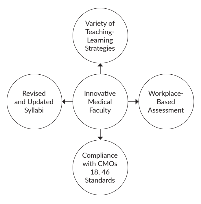
Figure 1. Joint Display of Medical Faculty Getting Innovative.

Actual syllabi, instructional designs and resources, tests, and other assessment tools shared by participants were analyzed. Observations and notes on these resources were raised during the FGDs. The type of curriculum track being pursued by participants surfaced immediately. In all sessions, participants openly said: "PBL kasi kami" (We follow PBL), "COME kami" (referring to those following the community-based medical education), "dati kaming competency-based pero ngayon ay OBE na" (we used to be competency-based but have shifted now to OBE). On the other hand, those who are still following the Flexnerian Curriculum quickly shared that they also used various teaching-learning (TL) strategies and assess learner achievement using workplace-based instruments instead of just written examinations. As