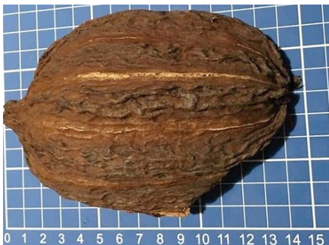
Figure 2. Dried T. cacao pod.