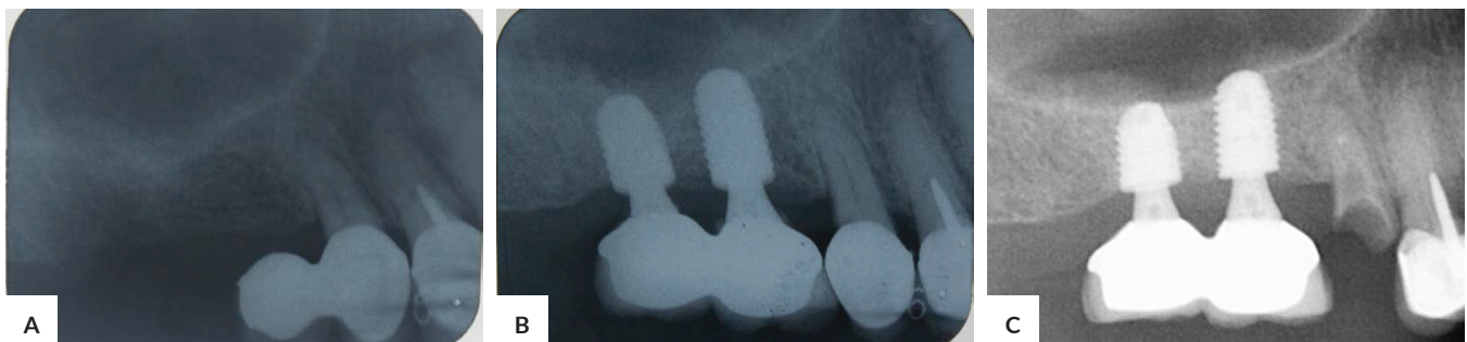
Figure 2. Double short implants in reduced bone dimension in posterior maxilla. A 63-year-old male patient required two implants in the right upper jaw. (A) In the radiograph minimal bone height was noted in the 16 and 17 sites, (B) two short implants, 6.5 and 8 mm, respectively were placed and splinted one another with ceramic crowns, (C) at 6 years follow up, radiograph showed good implant osseointegration and clearly demonstrated preservation of the vertical dimension of alveolar bone in the respective sites.