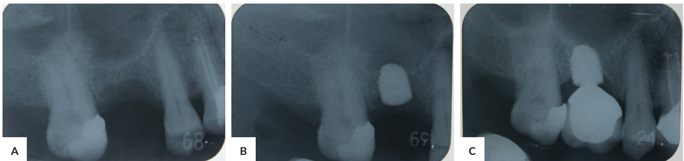
Figure 1. Single short implant in posterior maxilla. A 65-year-old male patient came with (A) edentulism at 16 site showing severe vertical bone resorption, (B) short (6.5 x 5.2 mm) implant was placed involving the use of transalveolar sinus floor elevation, (C) implant stability and minimal bone remodelling around the implant were evident 7 years after implant placement.

Case 3. A 72-year-old, came to have implant treatment to replace missing 14, 15 and 16 following extraction two months earlier. Intra operatively, poor bone healing and severe bone defect at 15 region was found. It was decided then to place 2 implants at 14 and 16. In the former site, a regular implant (Axiom®, Anthogyr, France) was placed while in the latter site, which was found to be of type IV bone, short (5.2 x 6.5 mm) implant was chosen because of minimal bone height due to the large antral floor (Figure 3A). At the second stage, standard abutments were inserted and three units porcelain fused to metal (PFM) bridge was cemented thereon (Figure 3B). Seven years later, the follow-up x-ray showed that both the implants survived and no signs of peri-implant bone loss were noted (Figure 3C).